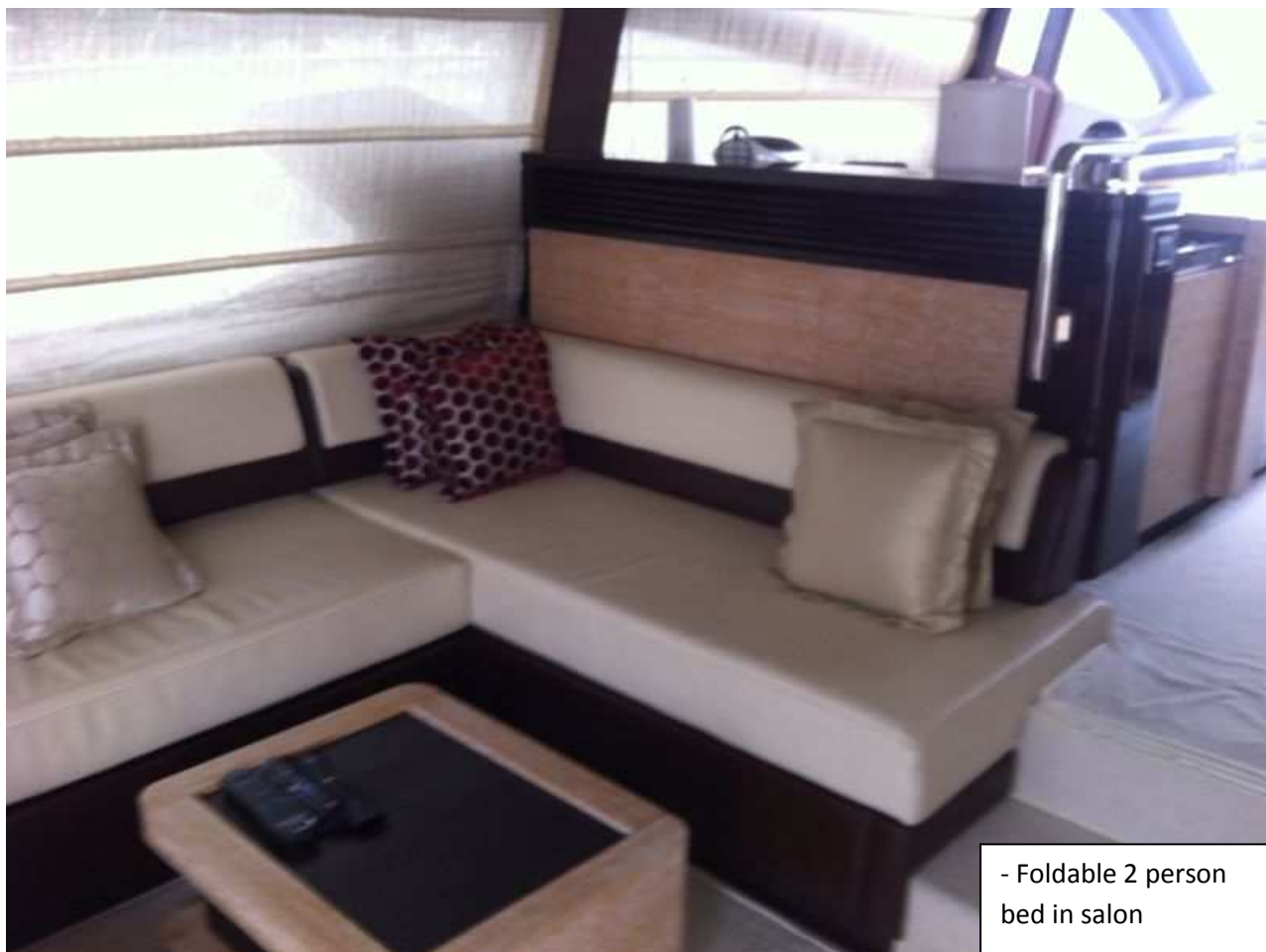
- Foldable 2 person bed in salon